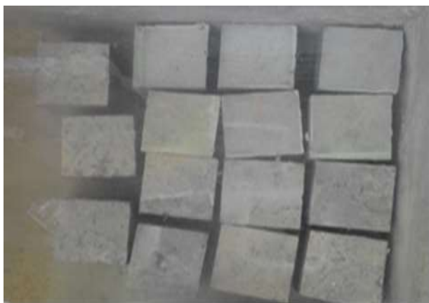
Fig. 1: Continuous water curing