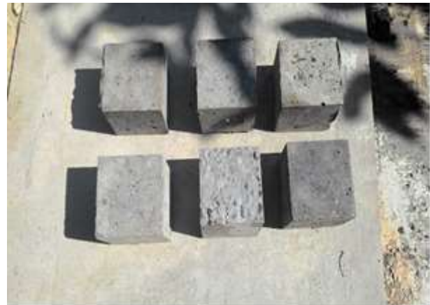
Fig. 4: Natural weather curing (under the open sky)