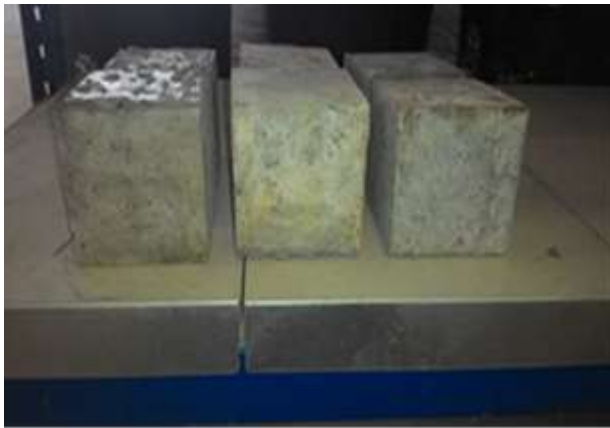
Fig. 3: Air curing (inside laboratory)