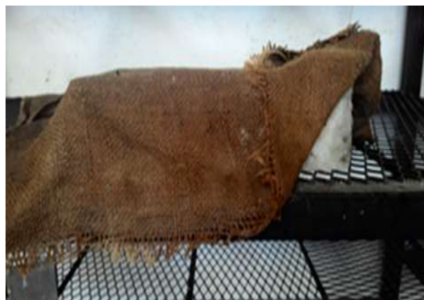
Fig. 2: Sprayed curing