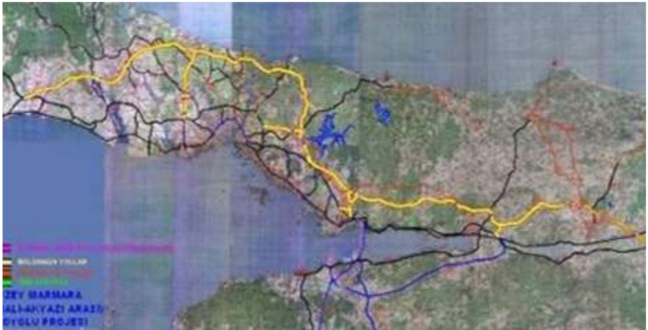
Fig. 2: 1/25000 scale İstanbul Northern Marmara Highway Master Plan, 2010 [6].

To understand the criticisms about the third bridge, the natural assets of İstanbul should be studied. In İstanbul Metropolitan Area there are seven catchment basin. They are located on the north of İstanbul and should be protected from every threaten caused by urban growth. They should be regarded as limits that shape urban macroform [7]. The forests on north and cultivated areas on north and north west are the other areas they should be protected and should be the limits of urban area. By considering these edges, İstanbul should be growing on east west line, not on north south line.