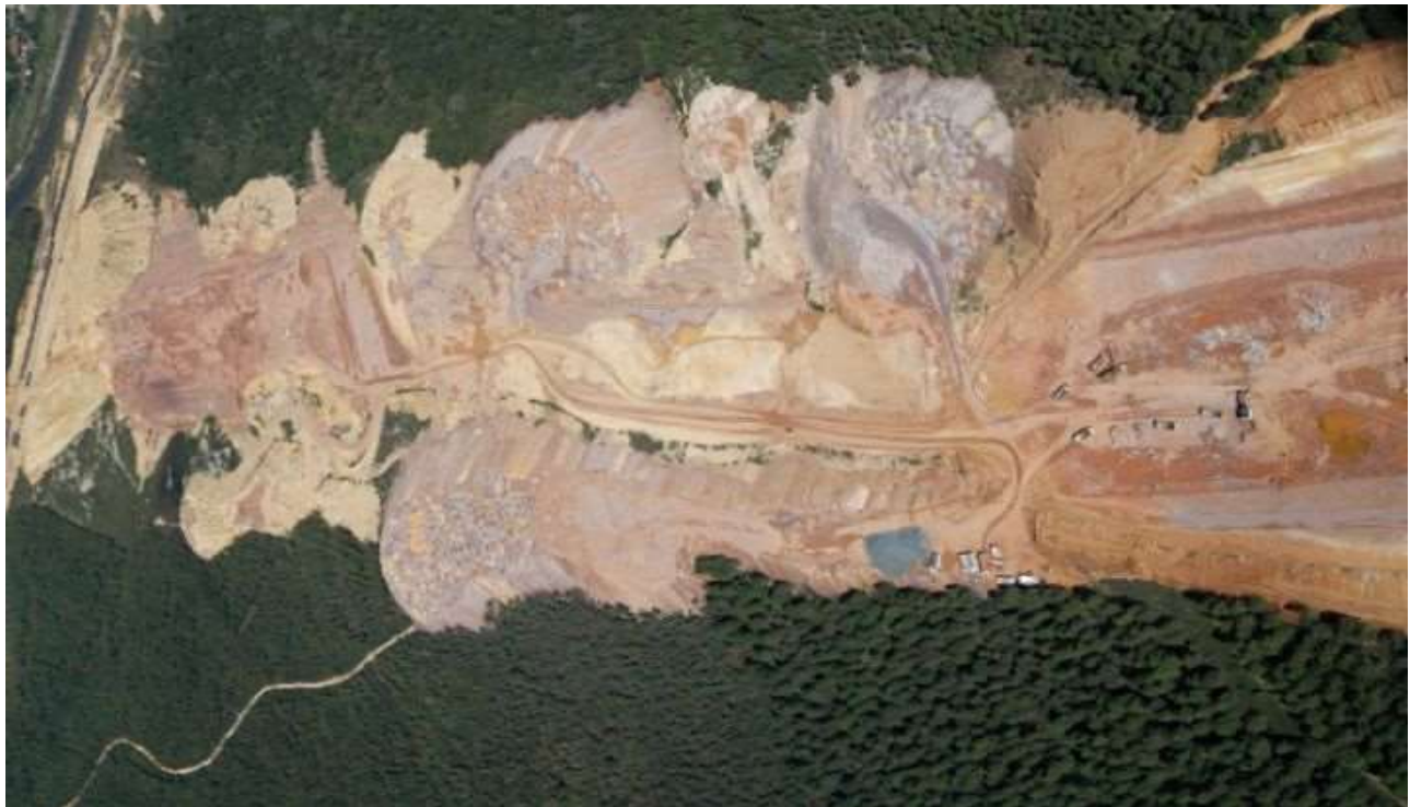
Fig. 4: Northern Marmara Highway Project Construction Area [12].

As it is seen The Third Bridge Project threatens İstanbul in many ways. This kind of project should have certainly an environmental impact assessment (EIA), but in this case the project was absolved from this process. The given reason is that the project was discussed as a public investment before 1997. Despite of the objections and protests of the academics and professional chambers, the project was started by avoiding plan decisions.