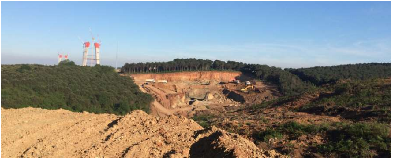
Fig. 3: Northern Marmara Highway Project Construction Area (Şentürk, 2014).

As it is seen The Third Bridge Project threatens İstanbul in many ways. This kind of project should have certainly an environmental impact assessment (EIA), but in this case the project was absolved from this process. The given reason is that the project was discussed as a public investment before 1997. Despite of the objections and protests of the academics and professional chambers, the project was started by avoiding plan decisions.